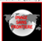
IMAGE SANS FRONTIERE IMAGE WITHOUT FRONTIER pour la promotion de l'image photographique de qualité for the promotion of quality photography