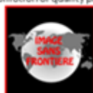
IMAGE SANS FRONTIERE IMAGEWITHOUT FRONTIER pour la promotion de l'image photographique de qualité for the promotion of quality photography